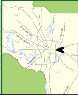
General Location Map