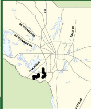
General Location Map