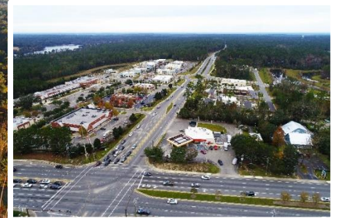
Northeast Corridor Connector: Bannerman Road & Meridian Greenway