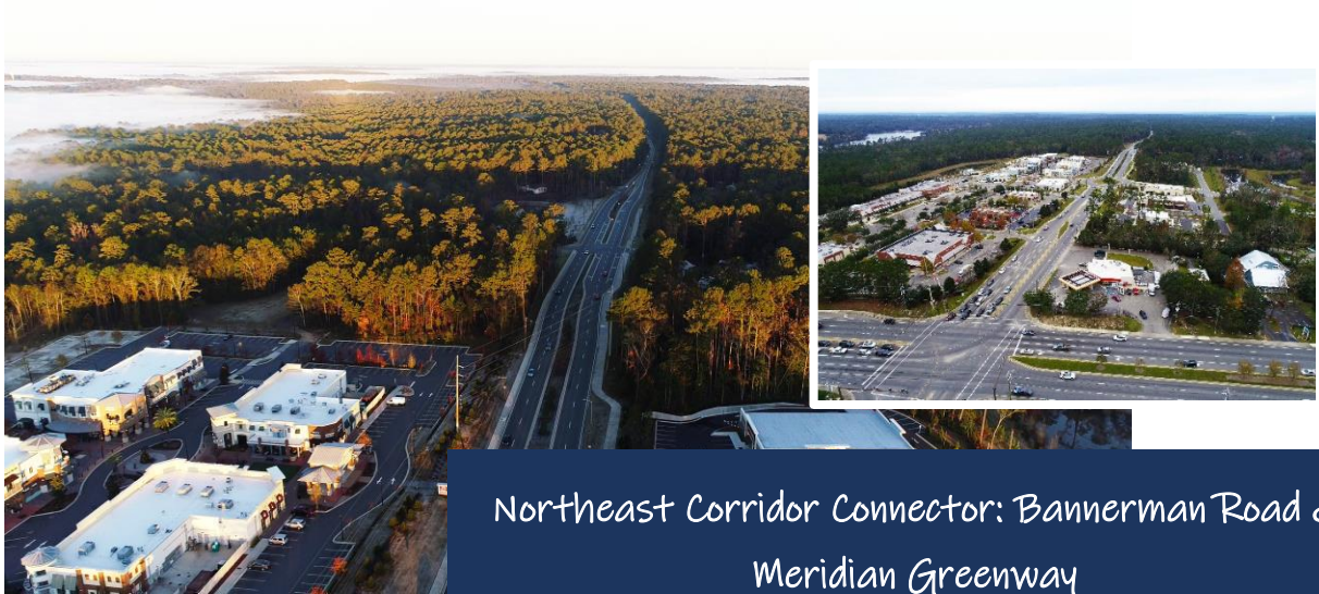
Northeast Corridor Connector: Bannerman Road & Meridian Greenway