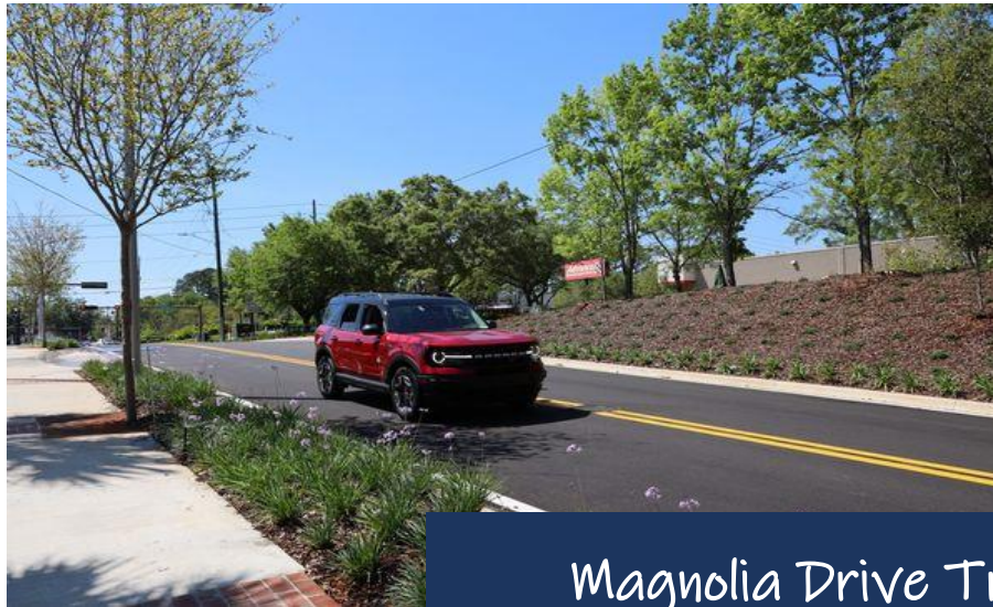
Magnolia Drive Trail