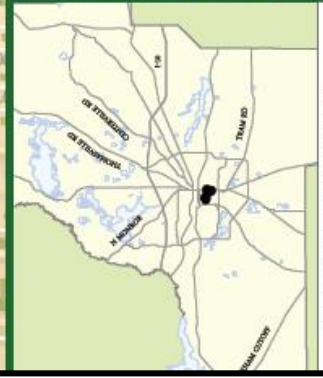
General Location Map