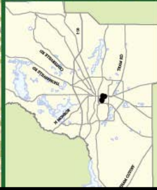
General Location Map