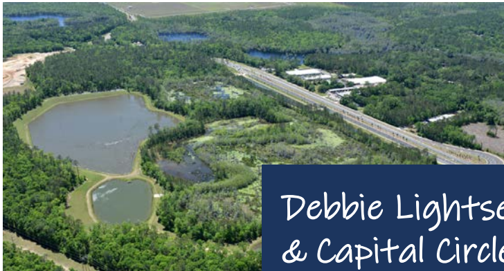
Debbie Lightsey Nature Park & Capital Circle SW Greenway