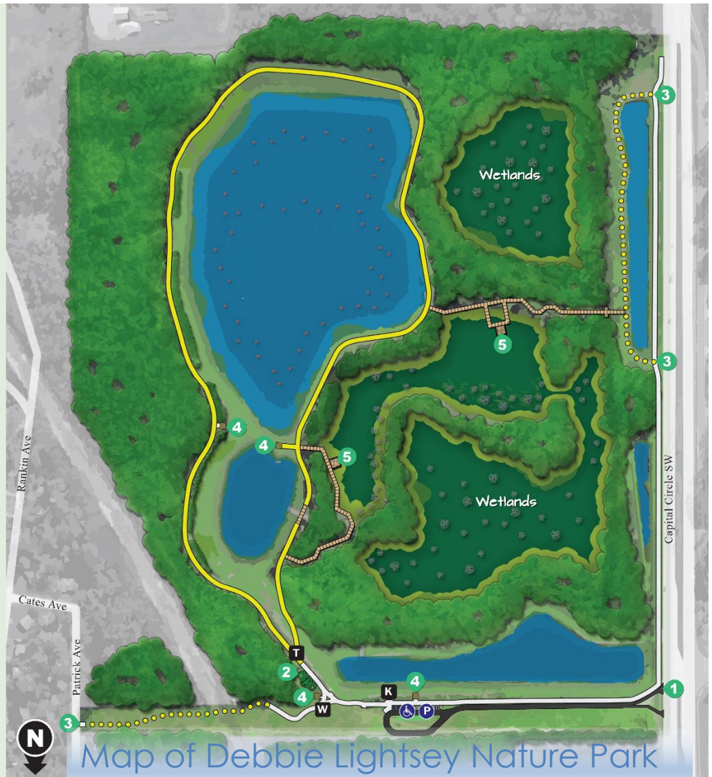
Map of Debbie Lightsey Nature Park