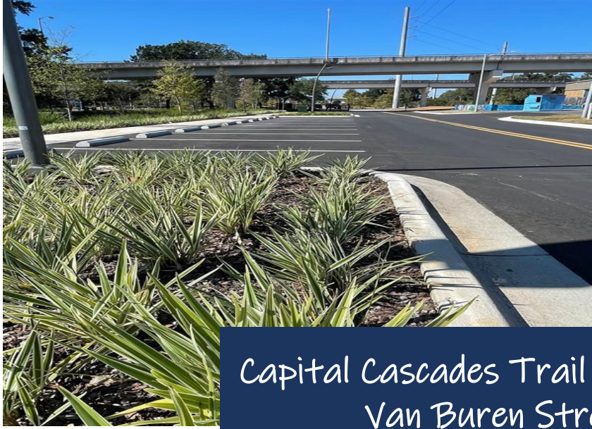
Capital Cascades Trail Segment 3 Van Buren Street