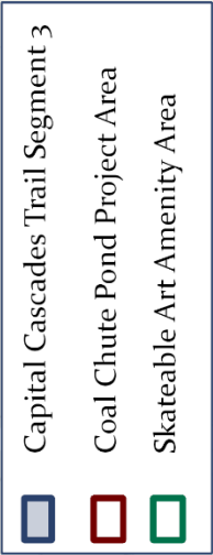
Capital Cascades Trail Segment 3 Map of Coal Chute Pond and Skateable Art Project Area