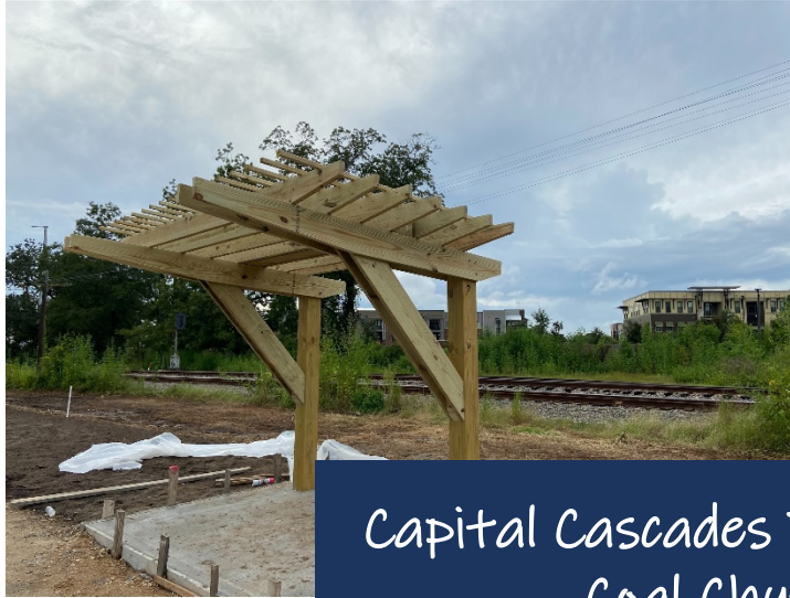
Capital Cascades Trail Segment 3 Coal Chute Pond