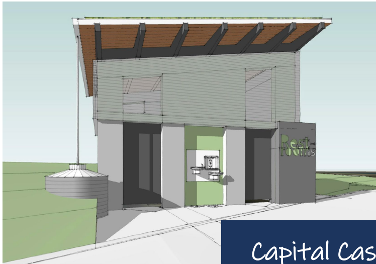
Capital Cascades Trail Restroom