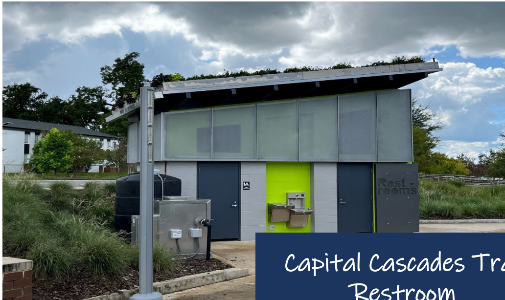
Capital Cascades Trail Restroom