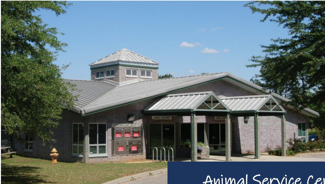
Animal Service Center