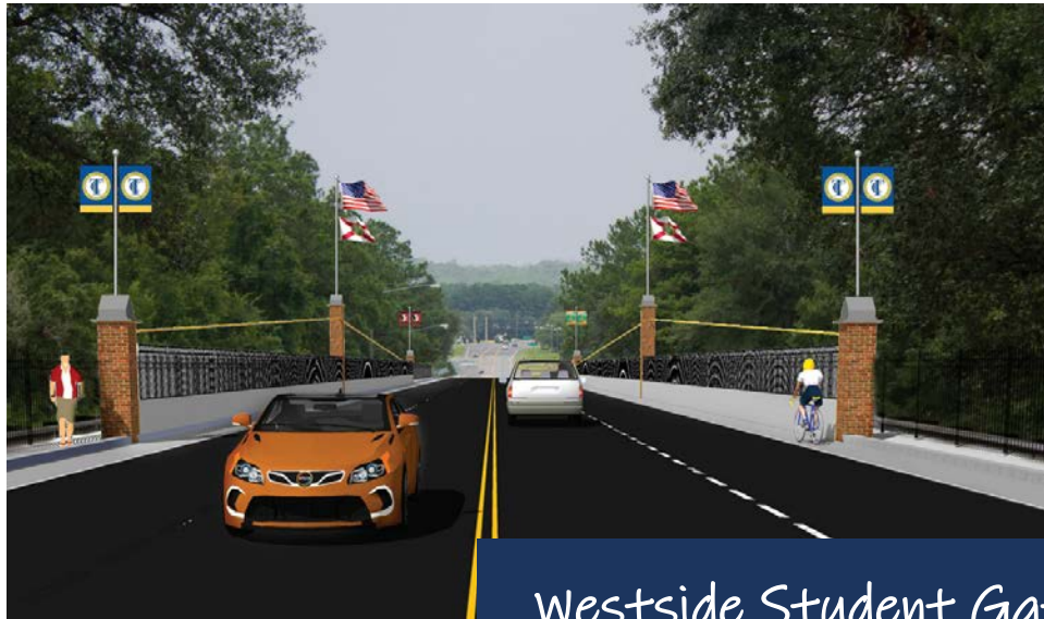
Westside Student Gateway