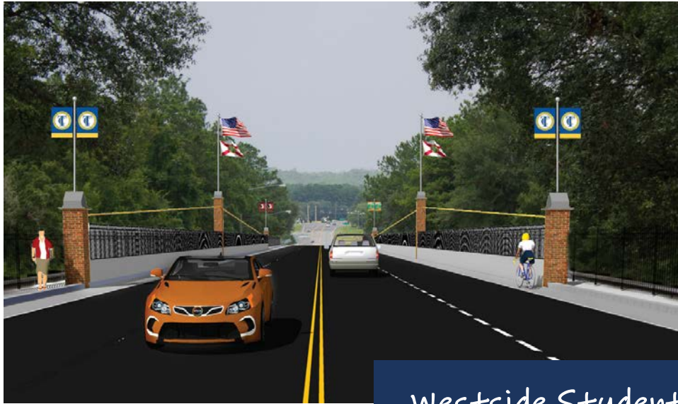
Westside Student Gateway