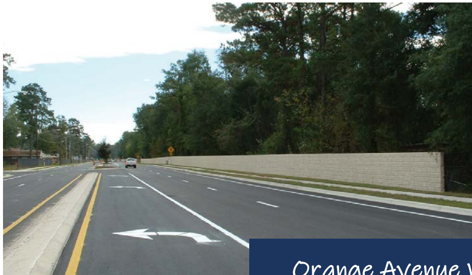
Orange Avenue Widening