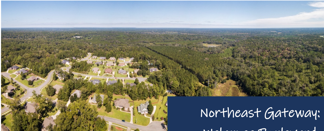
Northeast Gateway: Welaunee Boulevard