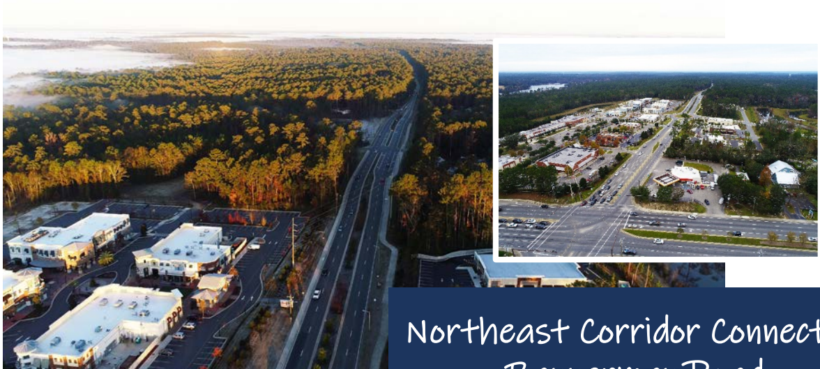
Northeast Corridor Connector: Bannerman Road