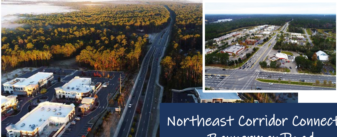
Northeast Corridor Connector: Bannerman Road