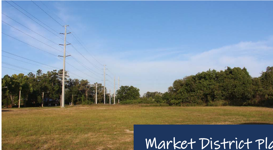
Market District Placemaking

(850) 219-1071 or susan.tanski@blueprintia.org