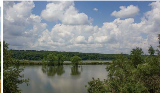
Lake Lafayette and St. Marks Regional Linear Park