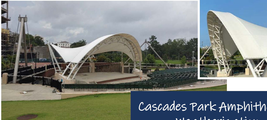
Cascades Park Amphitheater Weatherization