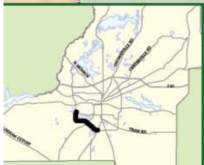
General Location Map