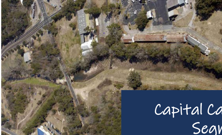
Capital Cascades Trail Segment 4