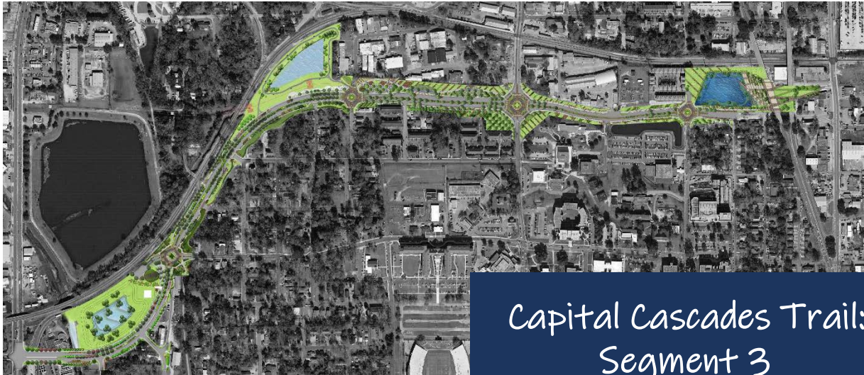
Capital Cascades Trail: Segment 3