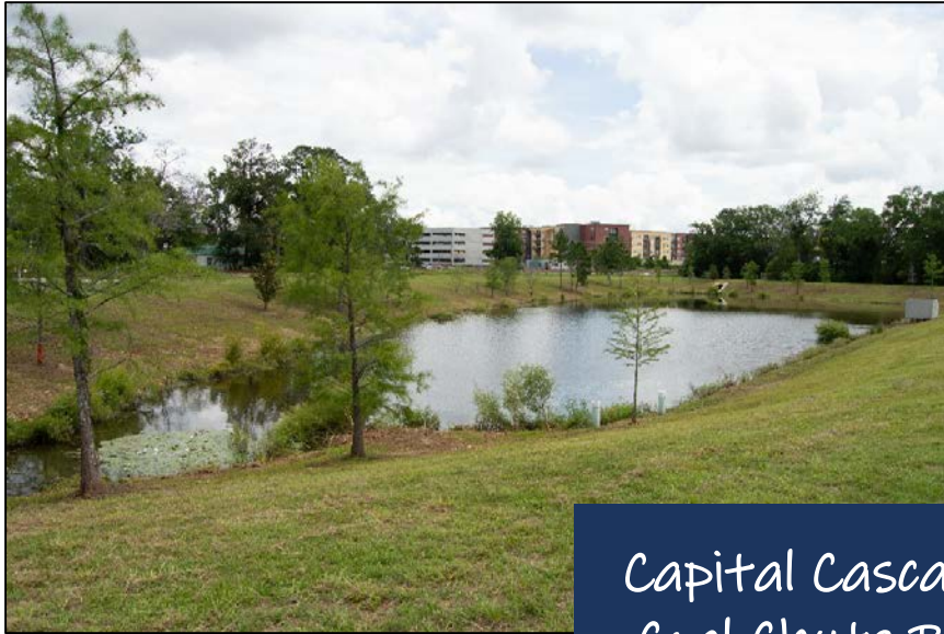
Capital Cascades Trail Segment 3 Coal Chute Pond & Skateable Art