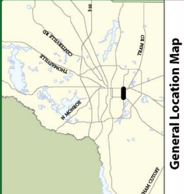
General Location Map