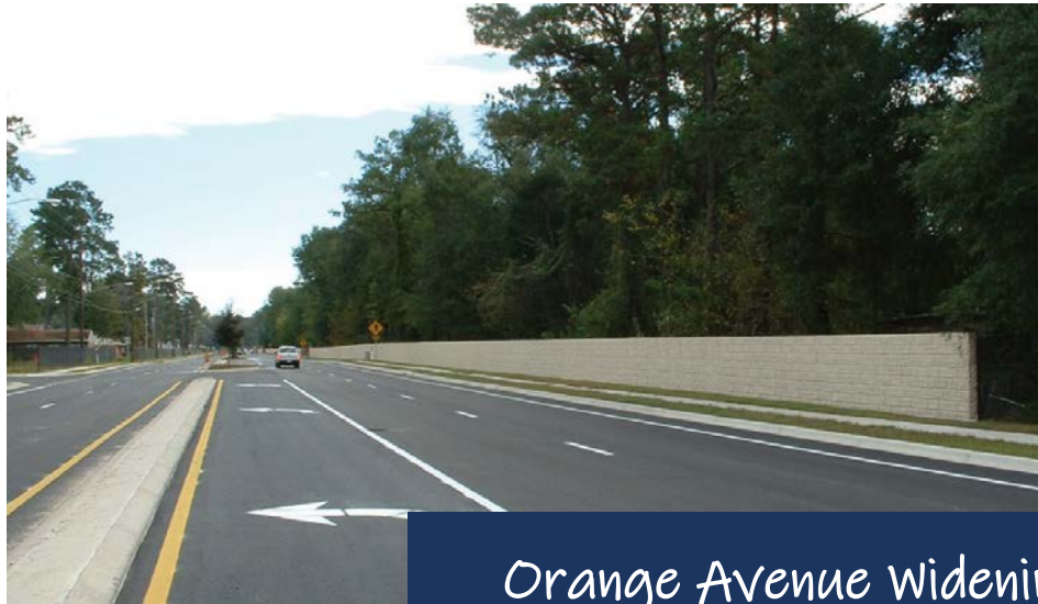
Orange Avenue Widening