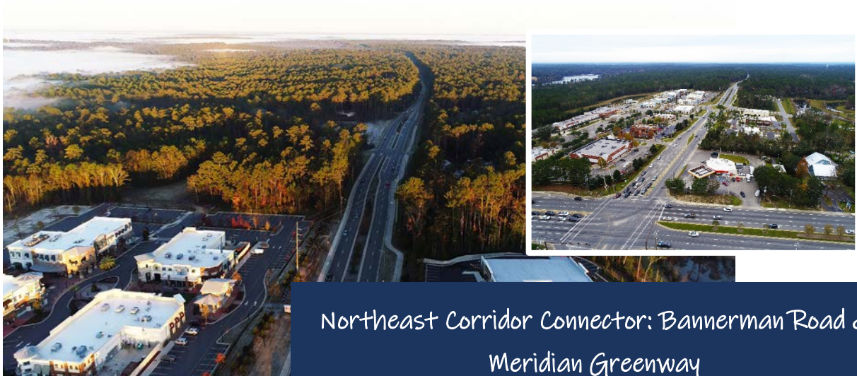
Northeast Corridor Connector: Bannerman Road & Meridian Greenway