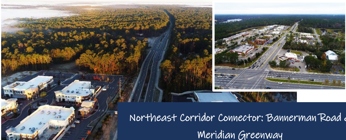
Northeast Corridor Connector: Bannerman Road & Meridian Greenway