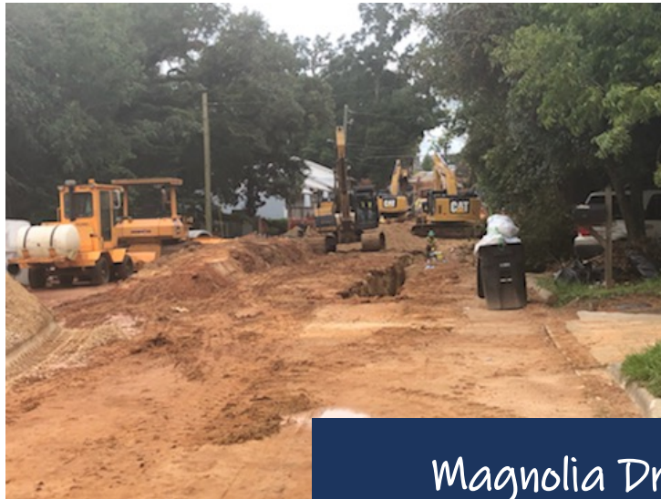
Magnolia Drive Trail