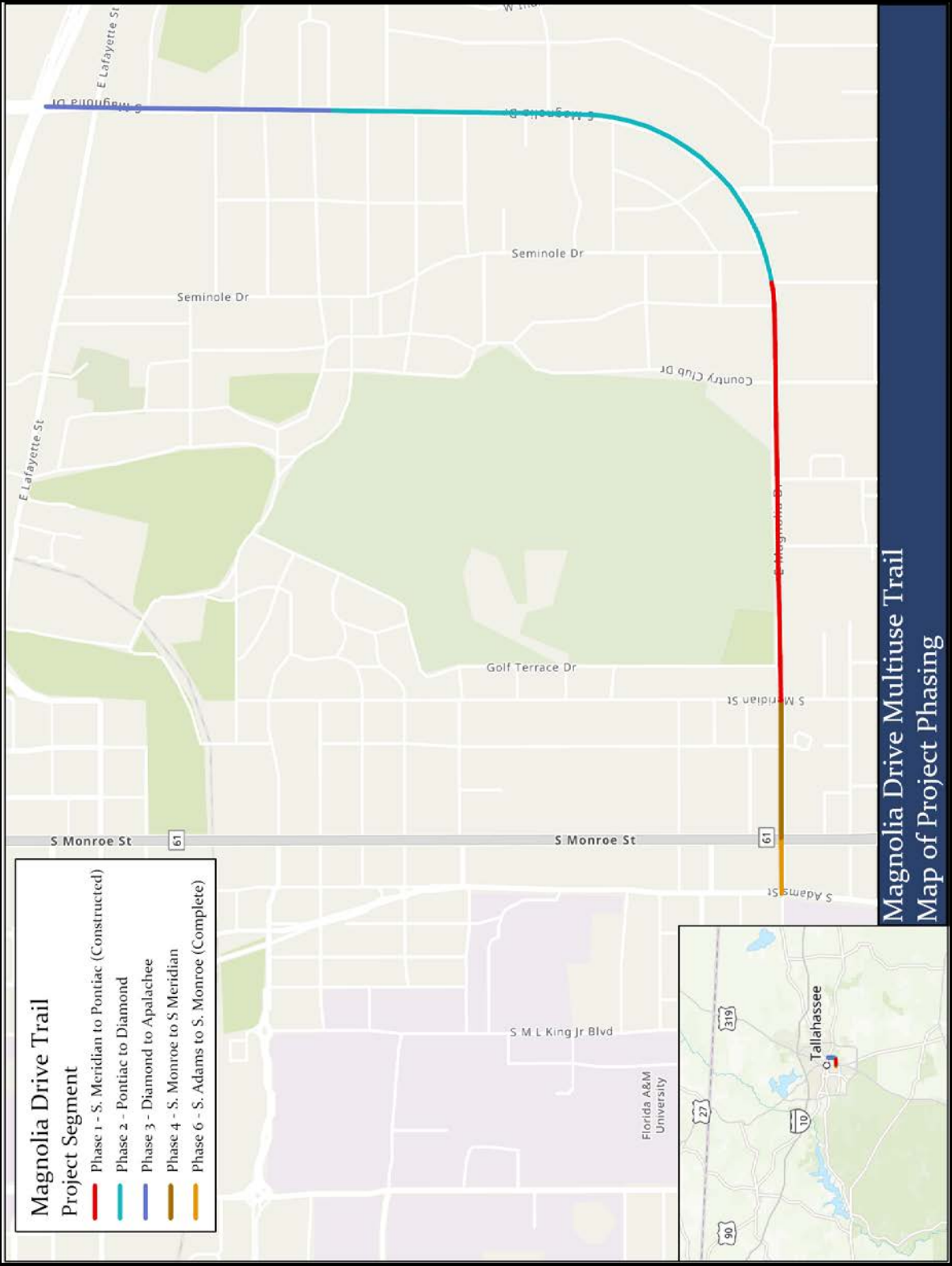
Magnolia Drive Multiuse Trail Map of Project Phasing