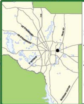
General Location Map