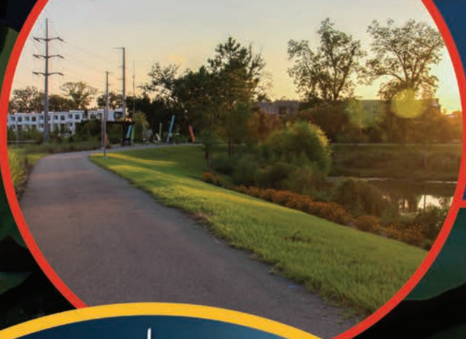
Coal Chute Pond Park