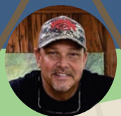
Bradley Cooley "The Jazz Man" sculpture