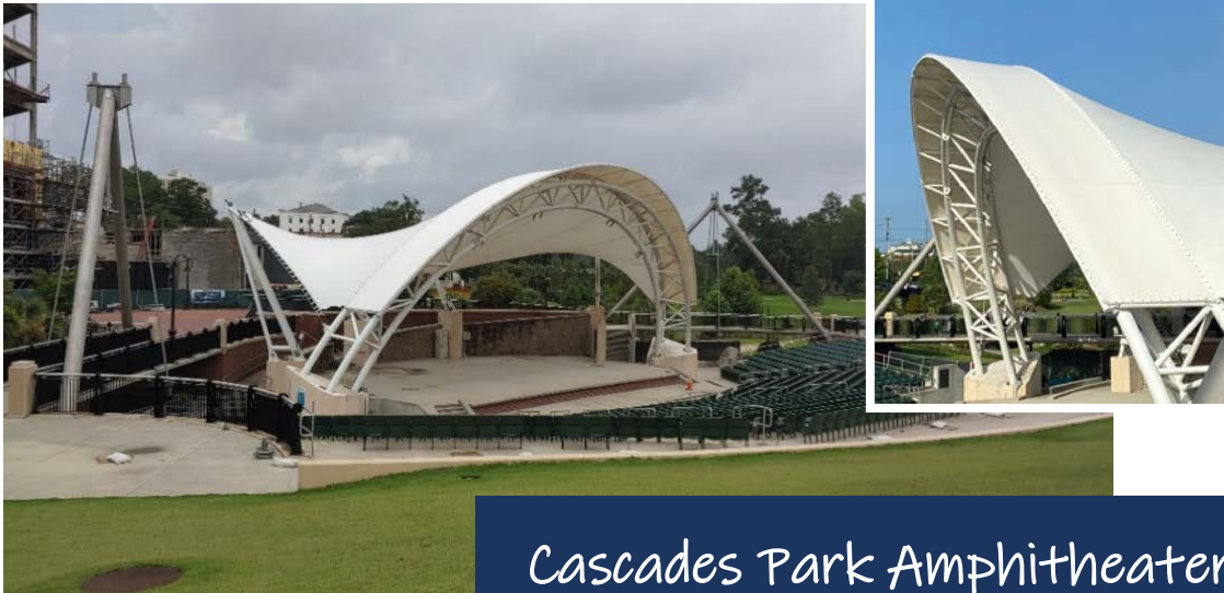
Cascades Park Amphitheater