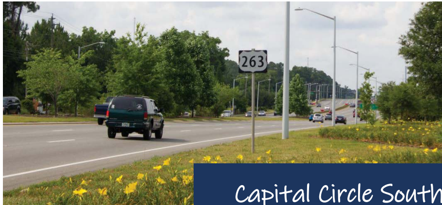
Capital Circle Southwest