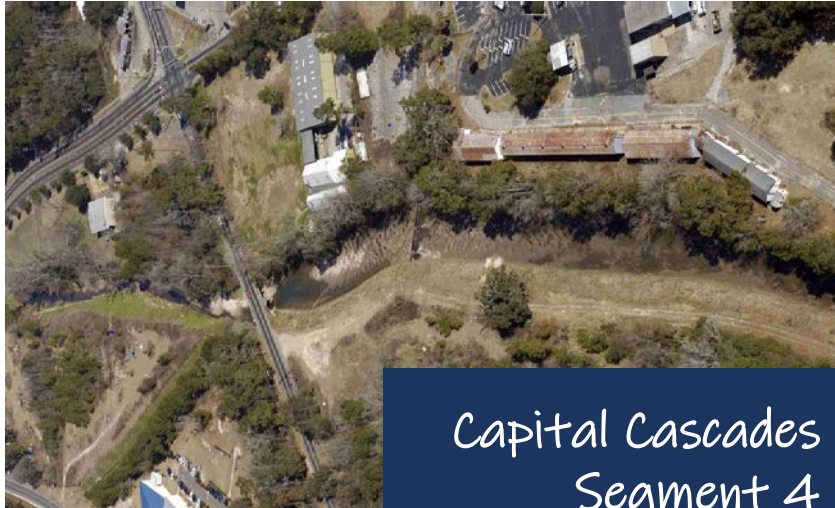
Capital Cascades Trail Segment 4