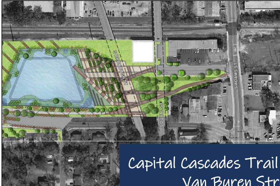
Capital Cascades Trail Segment 3 Van Buren Street