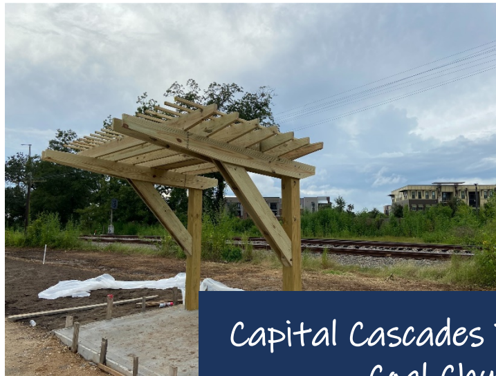
Capital Cascades Trail Segment 3 Coal Chute Pond