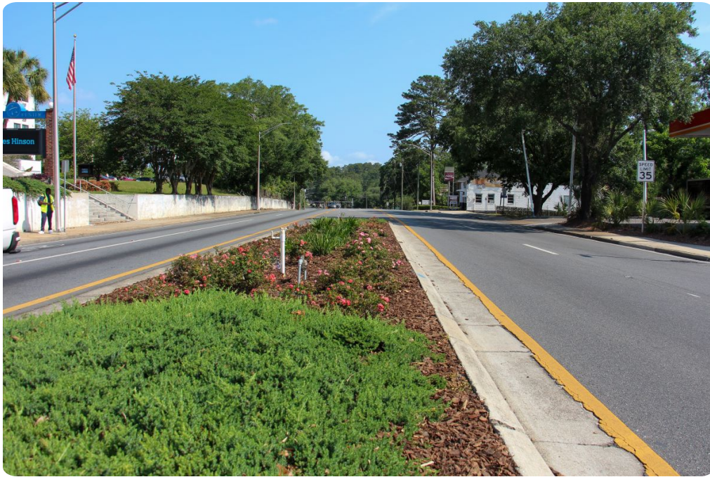
North Monroe Gateway

The Blueprint Infrastructure staff continually searches for outside funding to leverage the sales tax. As part of the promise to be faithful stewards of taxpayer dollars, these leveraging opportunities maximize the benefits to the public more than the sales tax dollars could alone.