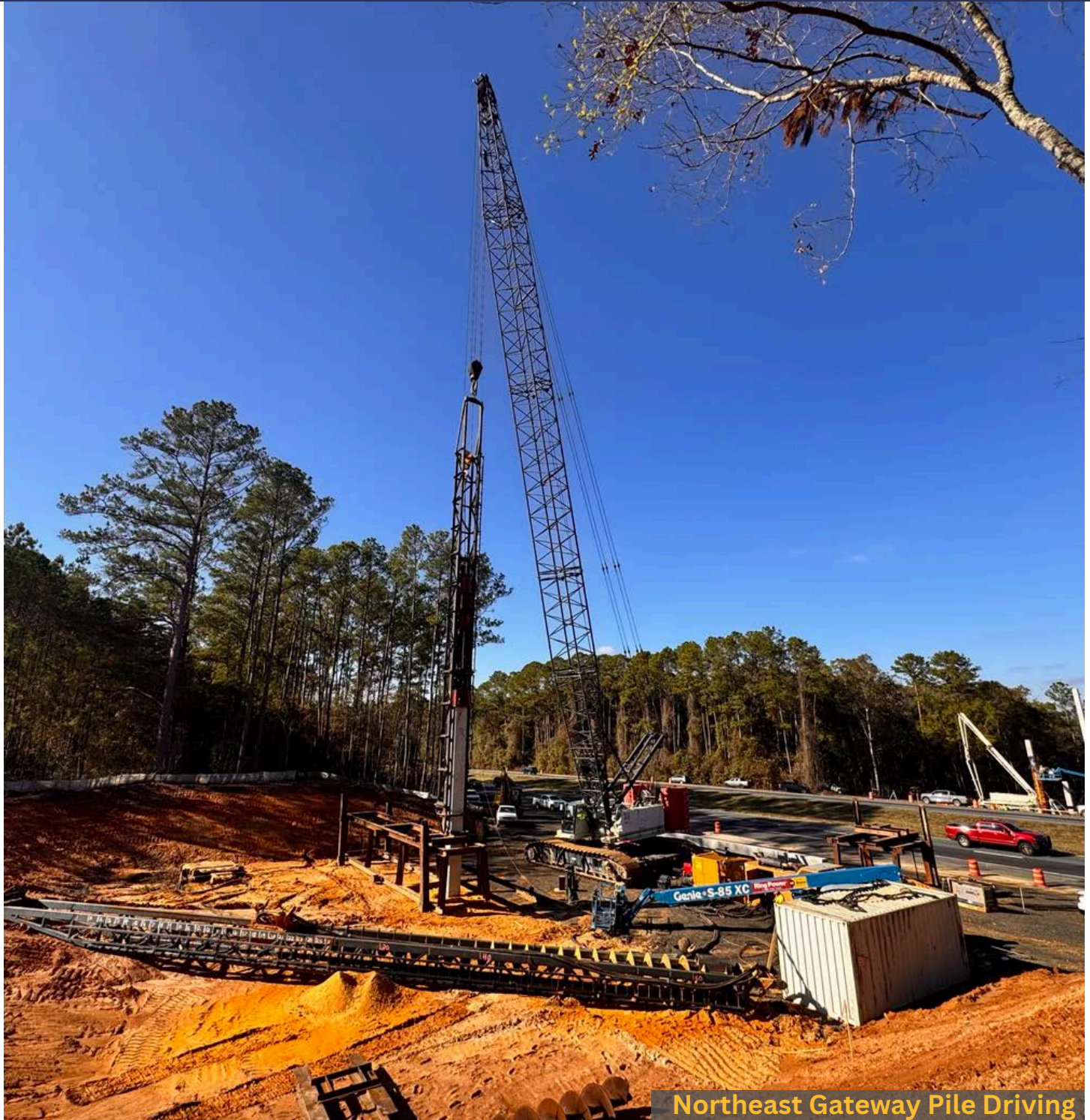
Northeast Gateway Pile Driving