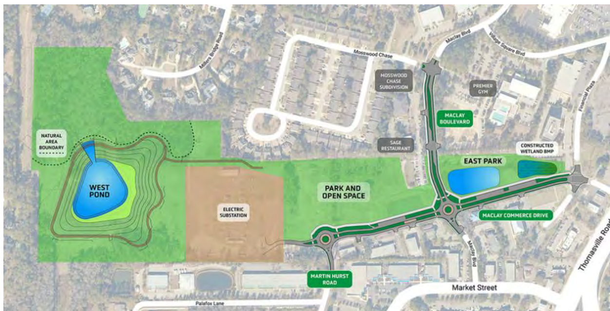
Figure 3. Blueprint Market District Park and City of Tallahassee Multi-Purpose Stormwater Project Area

The Market District Park will have ample parking to accommodate park visitors on a typical day. However, anticipating the need for additional parking during special events, Blueprint and the City of Tallahassee are in the process of negotiating parking agreements with the Florida Clerk of Courts Association (FCCA) and Maclay Center LLC, the adjacent property owners to the north of the Park. Blueprint will seek IA Board authorization, at