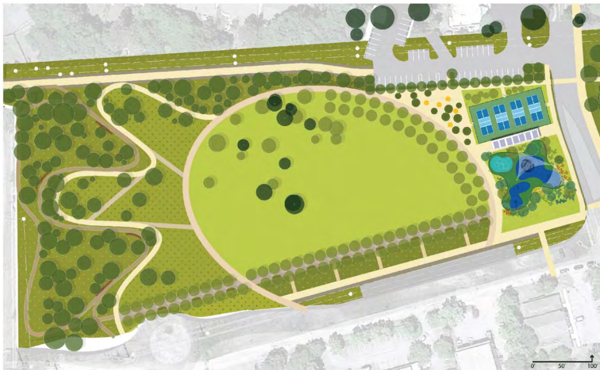
Figure 2. Market District Park Design Rendering

A breakdown of Market District Park cost estimate is provided in Table 2, below.