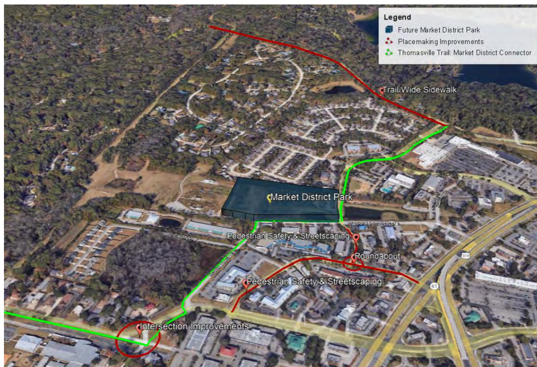
Figure 3. Market District Placemaking Map